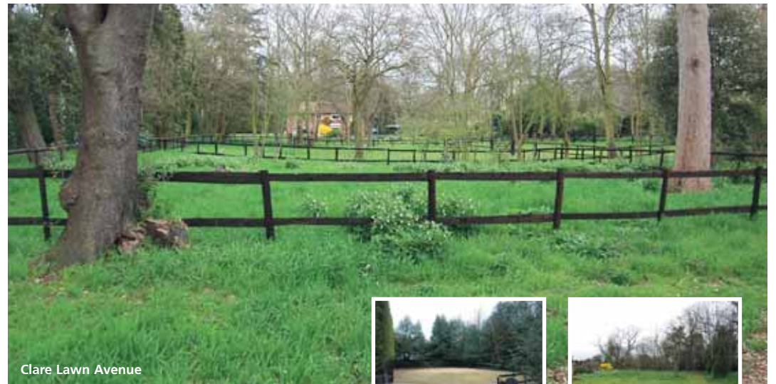
Clare Lawn Avenue