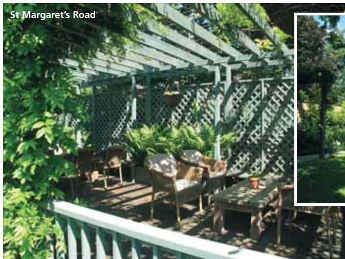
St Margaret's Road